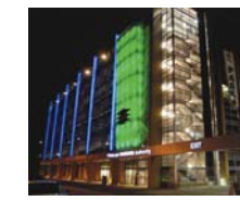
New Design, Less than 1,000 Spaces: Grant Street Transportation Center Garage Pittsburgh, PA Submitted by Pittsburgh Parking Authority