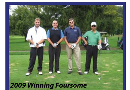
2009 Winning Foursome