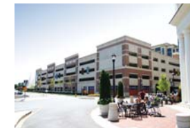
New Design, More than 1,000 Spaces: Annapolis Towne Centre Garages Parole, MD Submitted by Timothy Haahs & Associates, Inc.