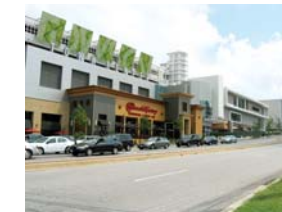
Addition/Improvement: Towson Town Center Garage Expansion Towson, MD Submitted by Timothy Haahs & Associates, Inc.