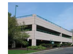
Parking Structure Restoration: Morris Corporate Center III Garage Parsippany, NJ Submitted by Wardle Engineering