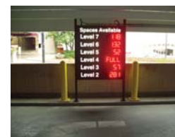
Parking Equipment: City of Akron Superblock Parking Deck Akron, OH Submitted by PSx